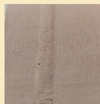
Anti Shrink and anti crack